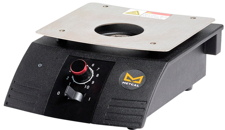
Rework small boards directly on the PCT-100

The PCT-100 can be used with or without a board holder. An Arm Rest is also available to steady your hand and keep your arm from being fatigued. The board holder and arm rest are available as a complete kit, with the PCT-100, or they can be purchased separately.