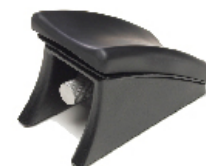
PCT-AR Arm Rest