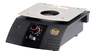
PCT-100 Pre-heater Convection Tool